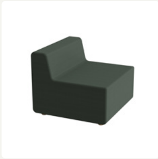
ML10 Single seater sofa