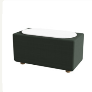
ML40 W/OPTION Half pouf with table