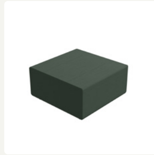
ML30 Square pouf