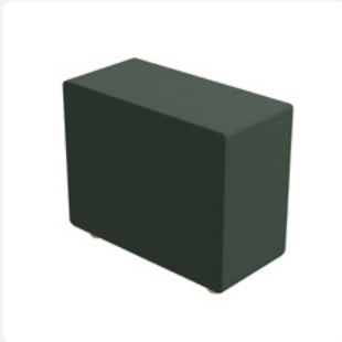
ML50 Tall half pouf