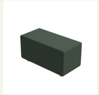
ML40 Half pouf