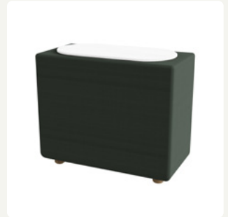
ML50 W/OPTION Tall half pouf with table