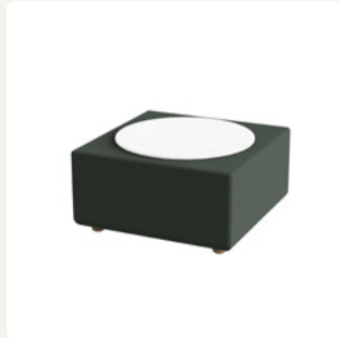
ML30 W/OPTION Square pouf with table