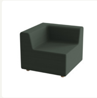
ML20 Single seater corner sofa