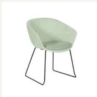
SO25 Fully upholstered, Black sled frame