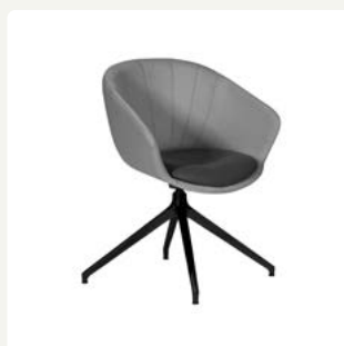
SO85 Fully upholstered, 4-star black swivel base & castors Optional aluminium base