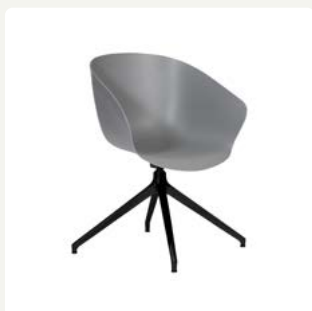
SO70 Plastic shell, 4-star black swivel base Optional aluminium base