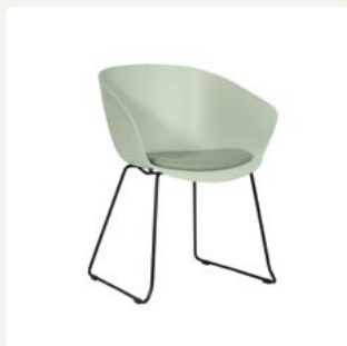
SO20 Plastic shell with UPH cushion, Black sled frame