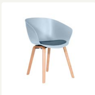
SO40 Plastic shell with upholstered cushion, Wooden leg frame