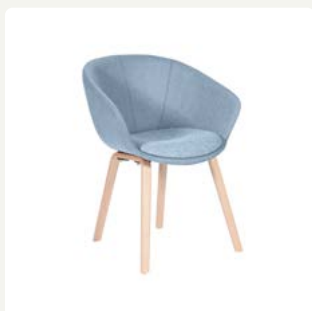
SO45 Fully upholstered, Wooden leg frame