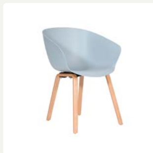
SO30 Plastic shell, Wooden leg frame