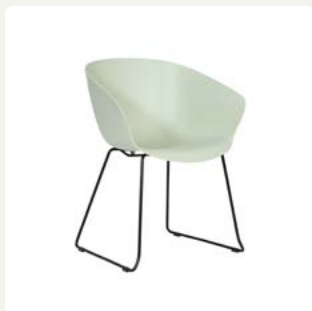
SO10 Plastic shell, Black sled frame