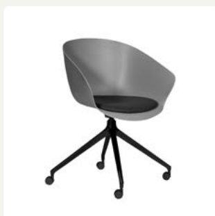
SO80 Plastic shell with upholstered cushion, 4-star black swivel base & castors Optional aluminium base