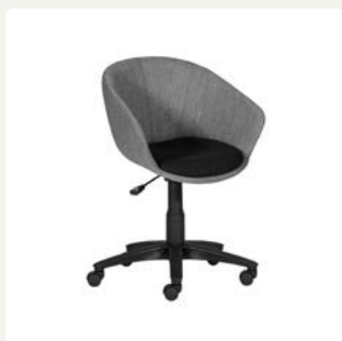
SO65 Fully upholstered, 5-star black height adjustable base Optional aluminium base